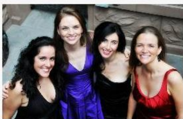
Image: ASPS Singers say thank you to LMCC!

Voices of Women presents a FREE concert!